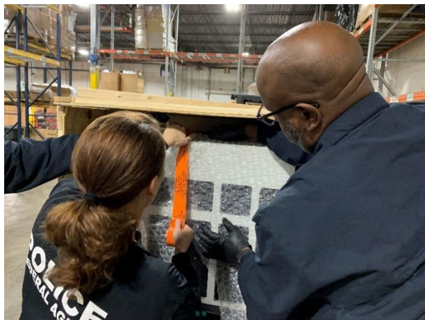
OEE Special Agents affecting a detention

The Penalty: On December 10, 2018, Yantai Jereh agreed to pay a $600,000 civil penalty. Additionally, a five-year denial of export privileges was imposed on Yantai Jereh, which was suspended provided that during the suspension period Yantai Jereh commits no future violations and pays the civil penalty, and eight additions were made to the BIS Entity List. A concurrent OFAC penalty in the amount of $2,774,972 was issued against Yantai Jereh and its affiliated companies and subsidiaries worldwide.