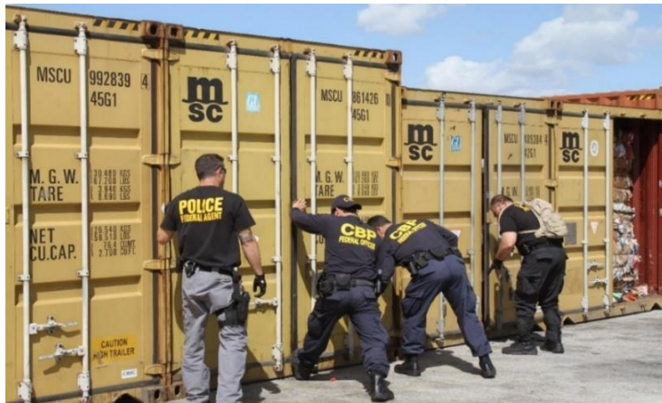
OEE Special Agents conducting an inspection

Fast-forward to the aftermath of September 11, 2001, and the focus of our country’s national security efforts pivoted to face a new and pressing threat of the terrorist attacks on our homeland by non-state actors like al-Qaeda. The changing nature of the threat meant OEE, in addition to investigating the proliferation of WMD and destabilizing military activities, also worked more closely with the Department of Defense to prevent U.S. components from getting into the hands of terrorists for use in improvised explosive devices. In parallel, we expanded the use of our Entity List to allow for the designation of parties when supporting any activity contrary to U.S. national security or foreign policy interests.