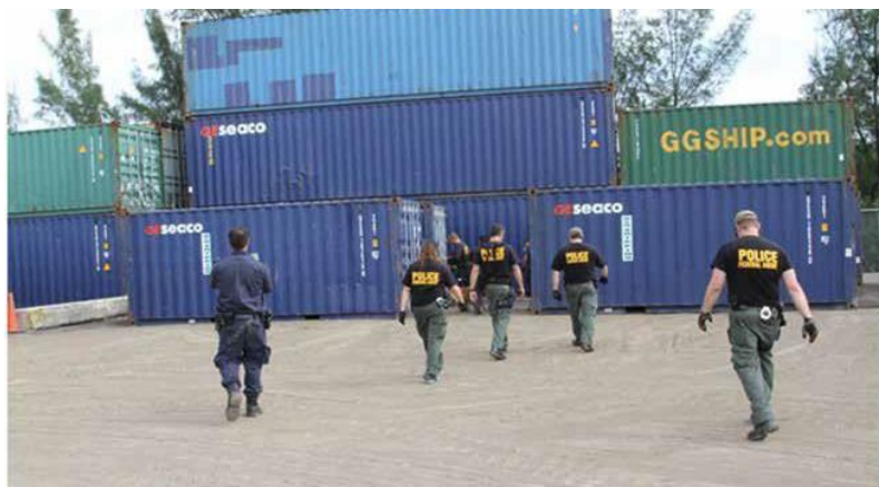
OEE Special Agents conducting inspections with U.S. Customs and Border Protection Officers

The Penalty: On June 9, 2021, Wu was sentenced to 52 months in prison (time served) and a $100 special assessment (suspended). In July 2022, Wu was deported from the United States. On December 1, 2022, BIS issued Wu a post-conviction denial order for a period of 10 years.