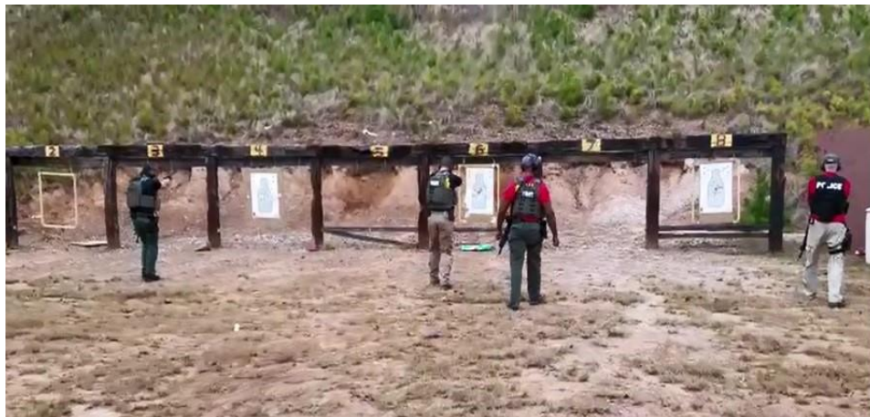
OEE Special Agents training at an outdoor firing range

special assessment. On September 10, 2019, Mohamadi was sentenced to 24 months in prison, 24 months of supervised release, and a $200 special assessment. On October 1, 2020, Shaneivar was sentenced to a $100,000 criminal fine and the forfeiture of three commercial properties appraised at over $2,000,000, and a $100 special assessment. On October 1, 2020, IC Link was sentenced to a $200,000 criminal fine and a $400 special assessment. On October 1, 2020, Alamdari was sentenced to a $5,000 criminal fine and a $100 special assessment. On March 6, 2023, BIS issued Mohamadi and Shaneivar post-conviction denial orders for a period of 10 years.