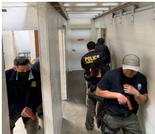
OEE Special Agents participating in a tactical training exercise