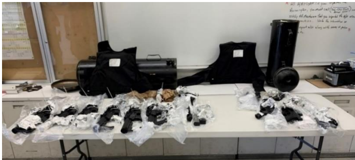
X-ray photo and photo of firearms concealed within air tanks, intercepted by Special Agents prior to their intended export